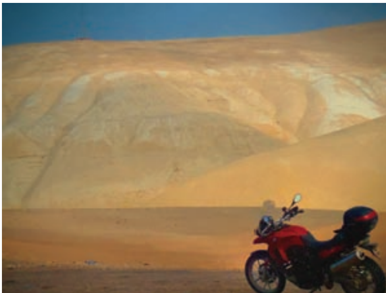
The writer's BMW against the sunbaked desert of southern Peru.

Motorcycling is a subtle sport, one that harnesses enormous forces with