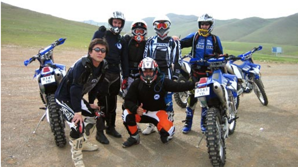
Mongolians stopped to stare at this bunch of motorcyclists

Day 1 Arrive Ulaanbaatar. Transfer to Continental Hotel.