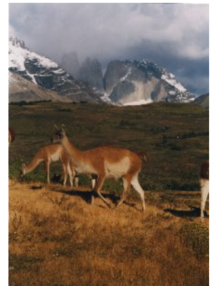
Guanacos at Torres del Paine