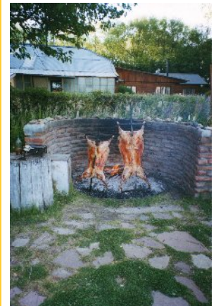
A traditional asado (bbq)

Whatever happens on this remote estancia one thing is for sure, you will remember this place for many years to come.