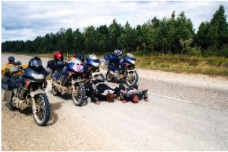
Bitumen at Last, Siberia