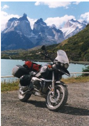
Lake Pehoe Torres del Paine National Park, Patagonia

To launch the beginning of our 2008 Patagonian season we are offering a 5% discount on the first tour of the season, the 17 day Patagonian Explorer PE-151108. Read on to discover some of the highlights of this most intriguing part of the world.